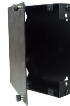
MPO/MTP® Cassette Module Shroud with Door P/N: AFP-LGX-SHROUD-WD