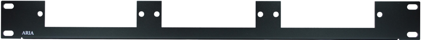
3X MPO/MTP® Cassette Module 1RU LGX Wallmount/Rackmount Bracket P/N: 3XLGXW-RBRACKET-B-OT