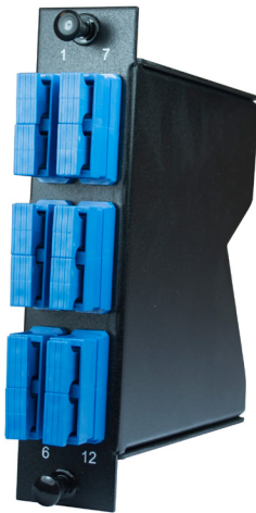
12 Fiber SC to 12 Fiber MPO/MTP®