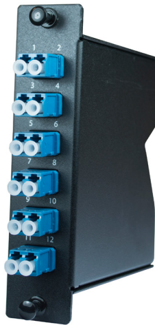
12 Fiber LC to 12 Fiber MPO/MTP®