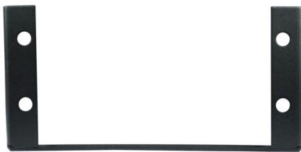
2X MPO/MTP® Cassette Module Wallmount Bracket P/N: 2XLGXWMBRACKET-B-OT