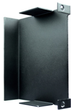
MPO/MTP® Cassette Module Shroud P/N: AFP-LGX-SHROUD