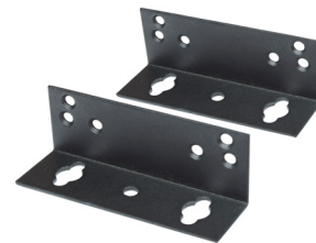
MPO/MTP® Cassette Module Wallmount Bracket P/N: MPO-BRACKET-B