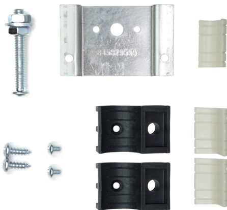
12A2 Cable Clamp for Dielectric Sheath Cable P/N: 106-230-337