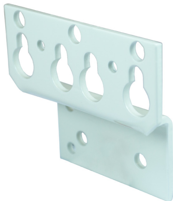
Bracket to accept 12A1 and 12A2 type cable clamps on LGX, OSEC, and ARM style enclosures (P/N: SRE-W)