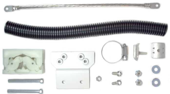
12A3 Cable Clamp for 0.25"-1.25" Diameter Cable P/N: 108-527-423