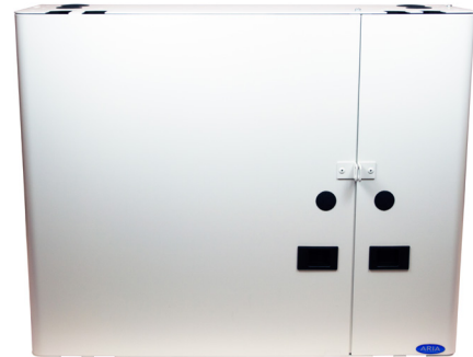
AWM 12 Wallmount Enclosure (12 mm ECAM only)