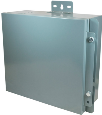
NEMA 8X Wallmount Enclosure